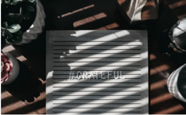
Our Victory in Gratitude The posture of giving thanks