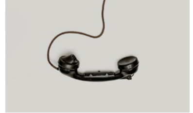
Our Hotline God is always faithful