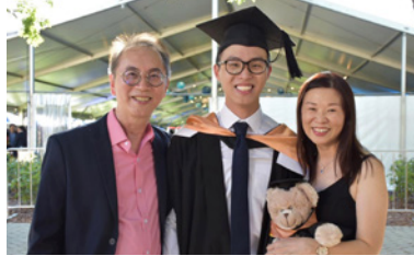
Swept Away...Into God's Loving Arms A journey of loss and grief